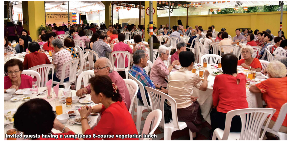
Invited guests having a sumptuous 8-course vegetarian lunch