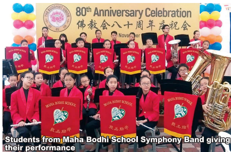
Students from Maha Bodhi School Symphony Band giving their performance